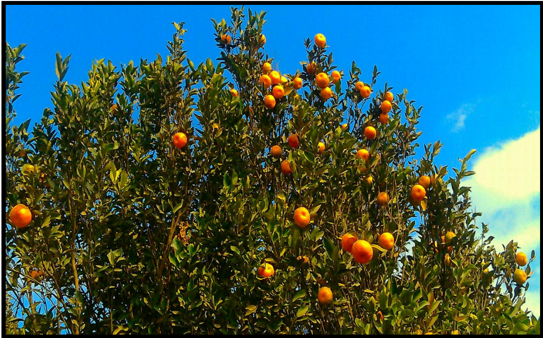
Fig 4: - A 100 year old Orange Tree in Narwan Village.

With the intervention of the Technology Mission Scheme and National Horticulture Mission for North Eastern Region, the farmers were given an awareness programme on orange orchard Management. Practical demonstration on different aspects of the subject was also given to the farmers within their orchards. One important component of the scheme known as “Citrus Rejuvenation Programme” for senile orchard was also implemented in this village during 2009-10, 2011-12 by distribution of free inputs of nutrient supplement and pesticides. There are owners who have initiate scientific approach in orchard plantation with the help of Horticulture Department.