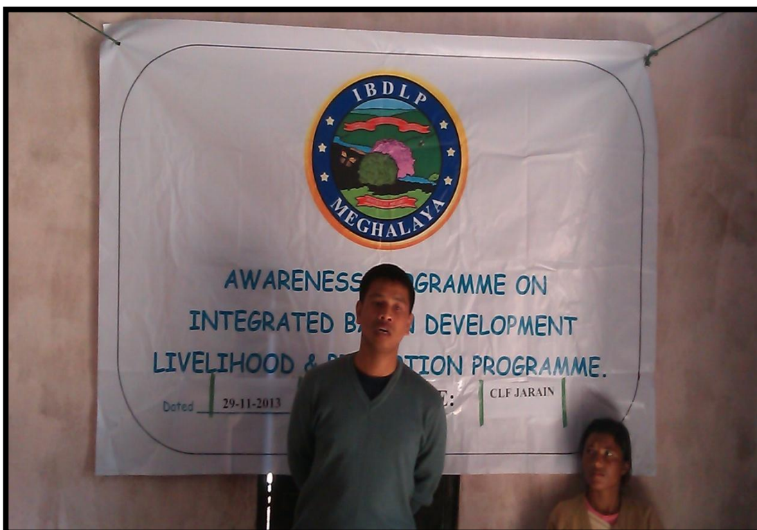
Fig.4: Delivery of speech about basic IBDLP by ERP, CLF Jarain.