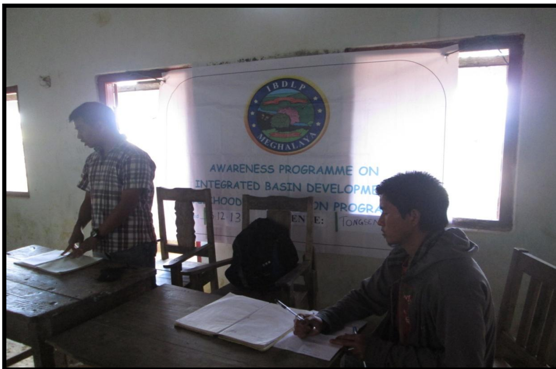
Fig.7: Delivery of speech about IBDLP by ERP, CLF Tongseeng.