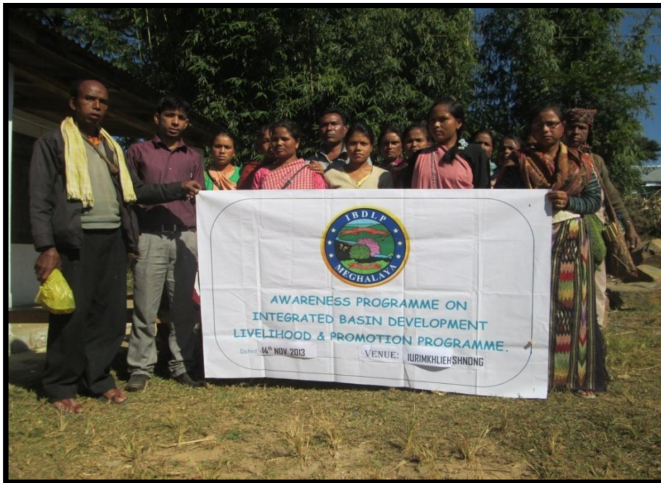
Pic7: Awareness Programme on IBDLP at Jurimkhliehshnong Village in Collaboration with Iasynroplang CLF.