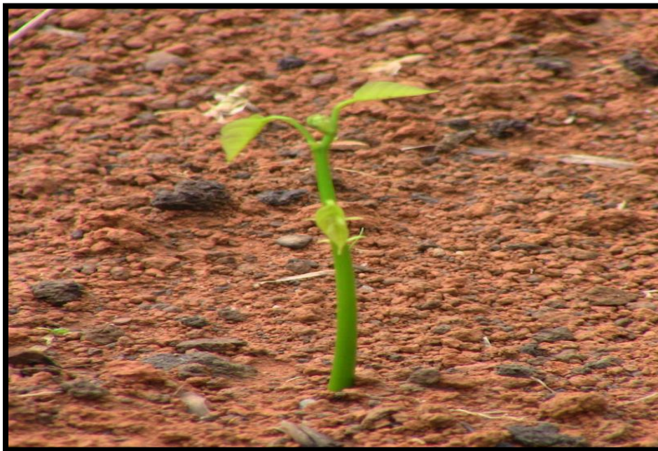
Fig 3:- one week Pongamia plant