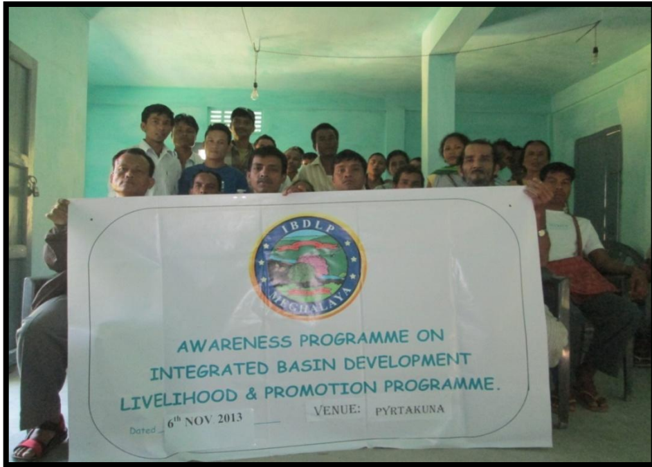
Pic5: Awareness Programme on IBDLP at Pyrtakuna Village in Collaboration with Seiborlang CLF.