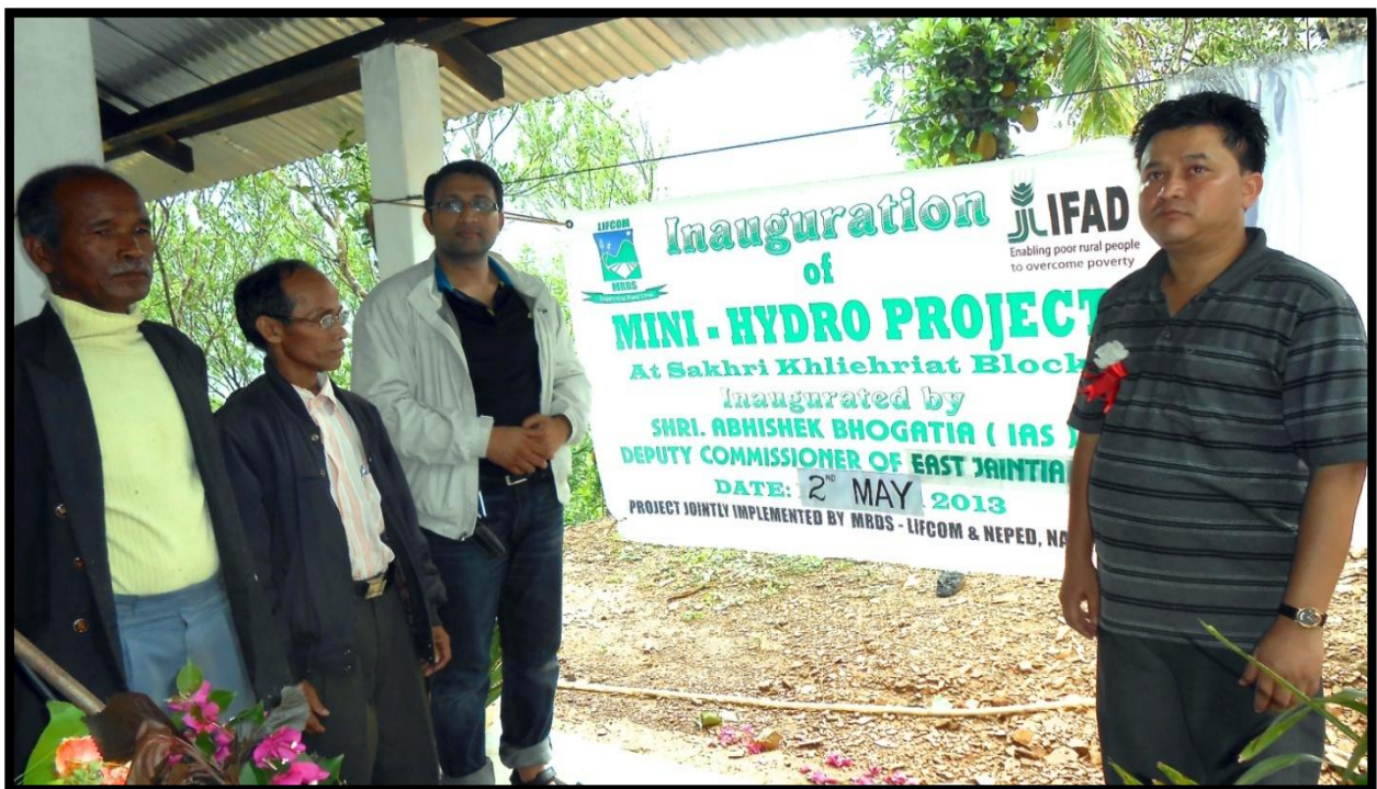
Fig: - Inauguration of Mini hydroger project

Sakhri village came into existence in 1983. It is a remote area with one and half hour walk from Tongseng village. Initially there were 10 Households with 30 people registering as first bona fide residence of the village. But at present there are 36 households with a total population of 192. However, there is hardly any development taken place in the village due to pitiable communication, absence of electricity connection, non recognition of the village by the Government, absence of convergence programmes by the line departments, non existence of Sakhri village to adjacent villages.