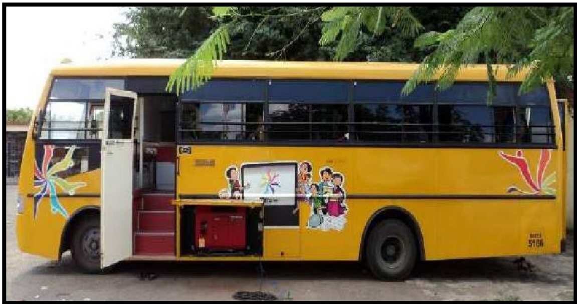
Fig: - Computer Bus