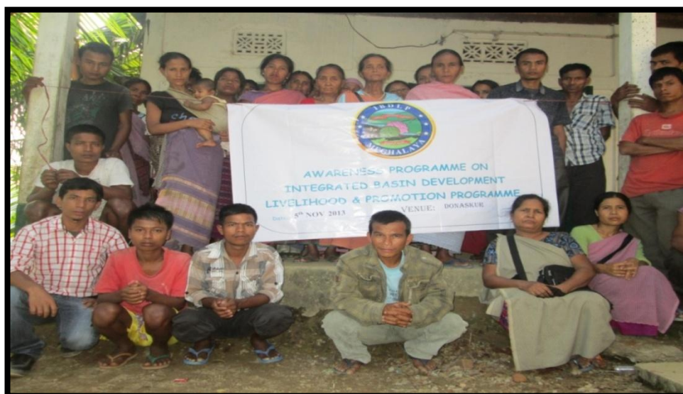
Pic4: Awareness Programme on IBDLP at Donaskur Village in Collaboration with lasnohktlang CLF.