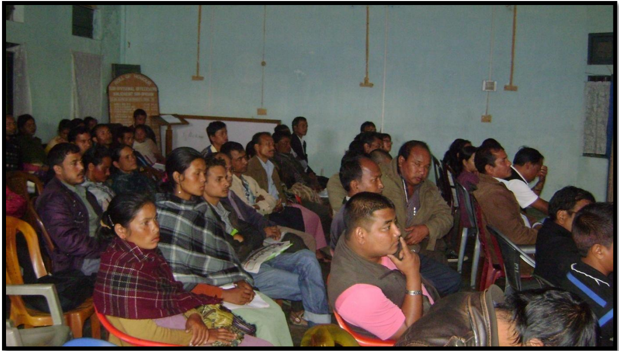
Fig: - 5