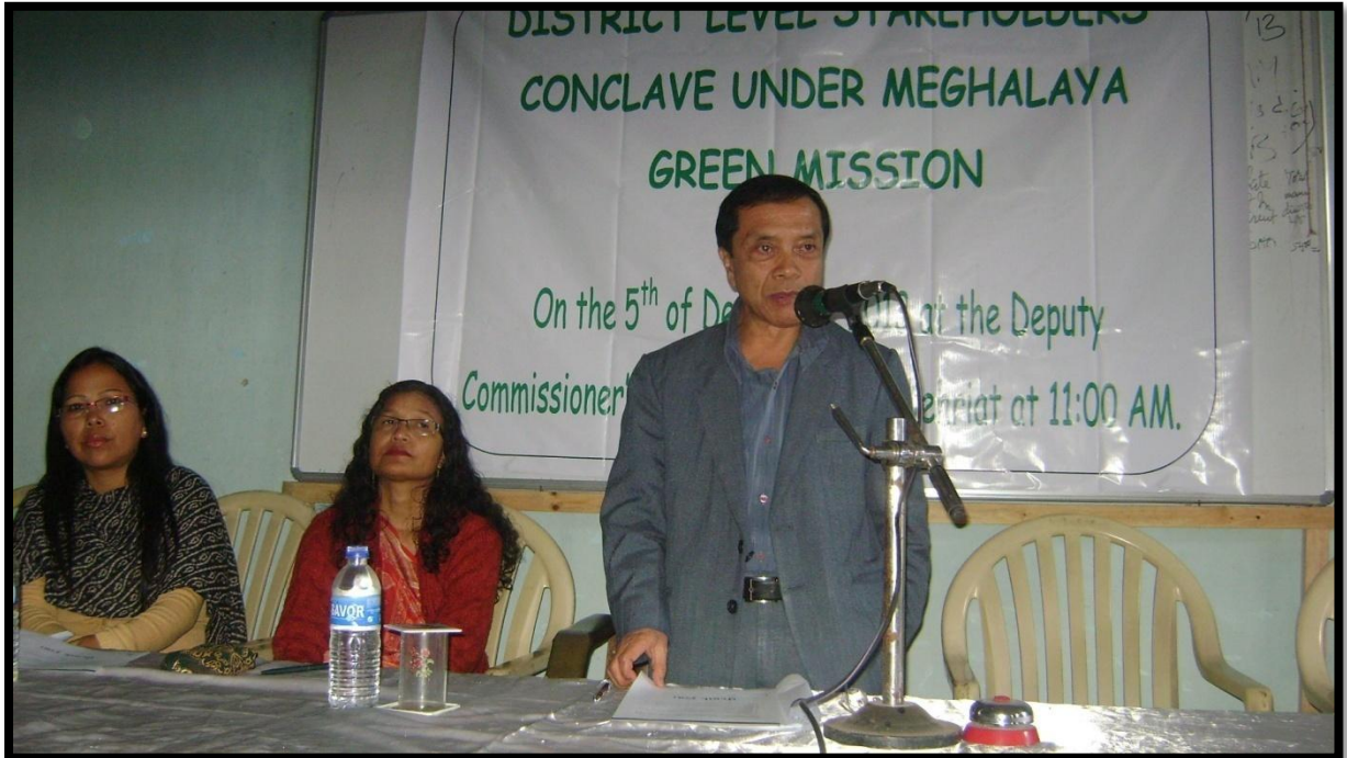
Fig: - 6