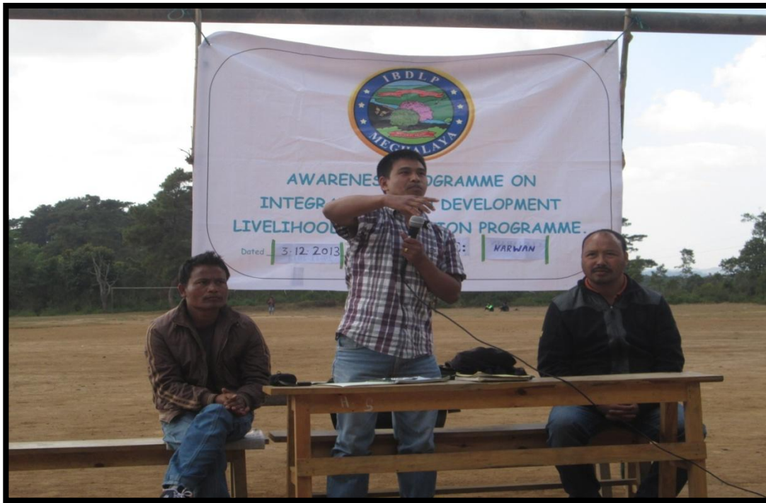
Fig.1: Delivery of speech about basic IBDLP by ERP, Narwan.