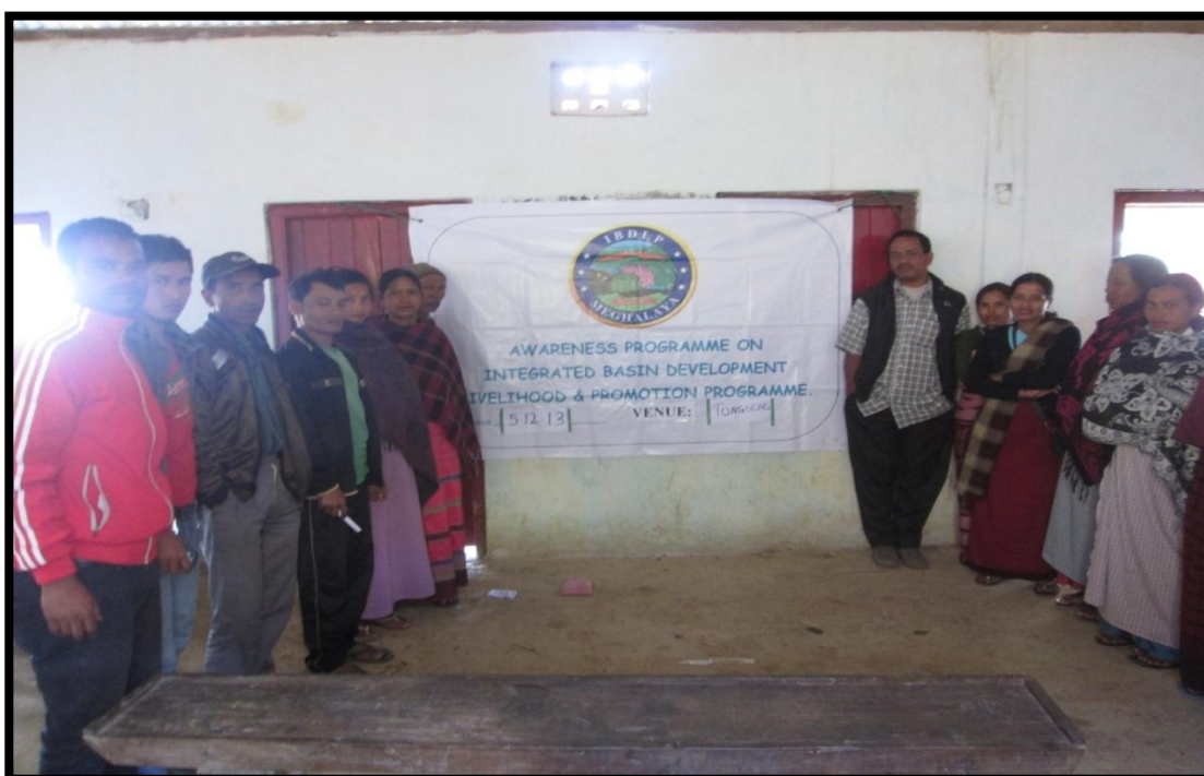
Fig.8: Group photo after the programme, CLF Tongseeng.