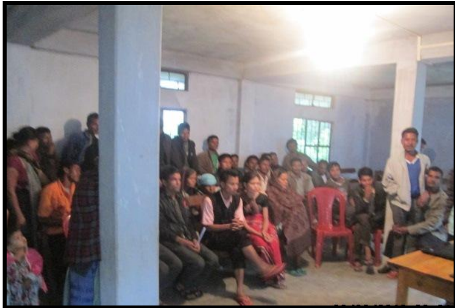
Pic3: Villagers of Nongthymme village participating in the Awareness Programme on IBDLP.