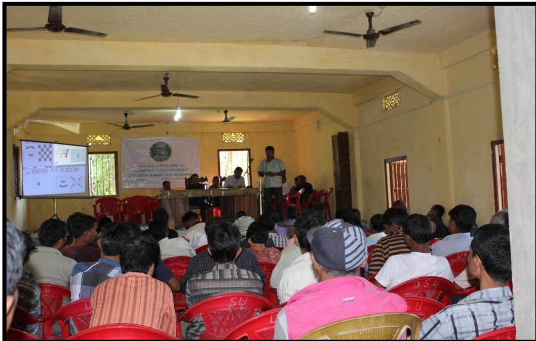
Fig : - 4