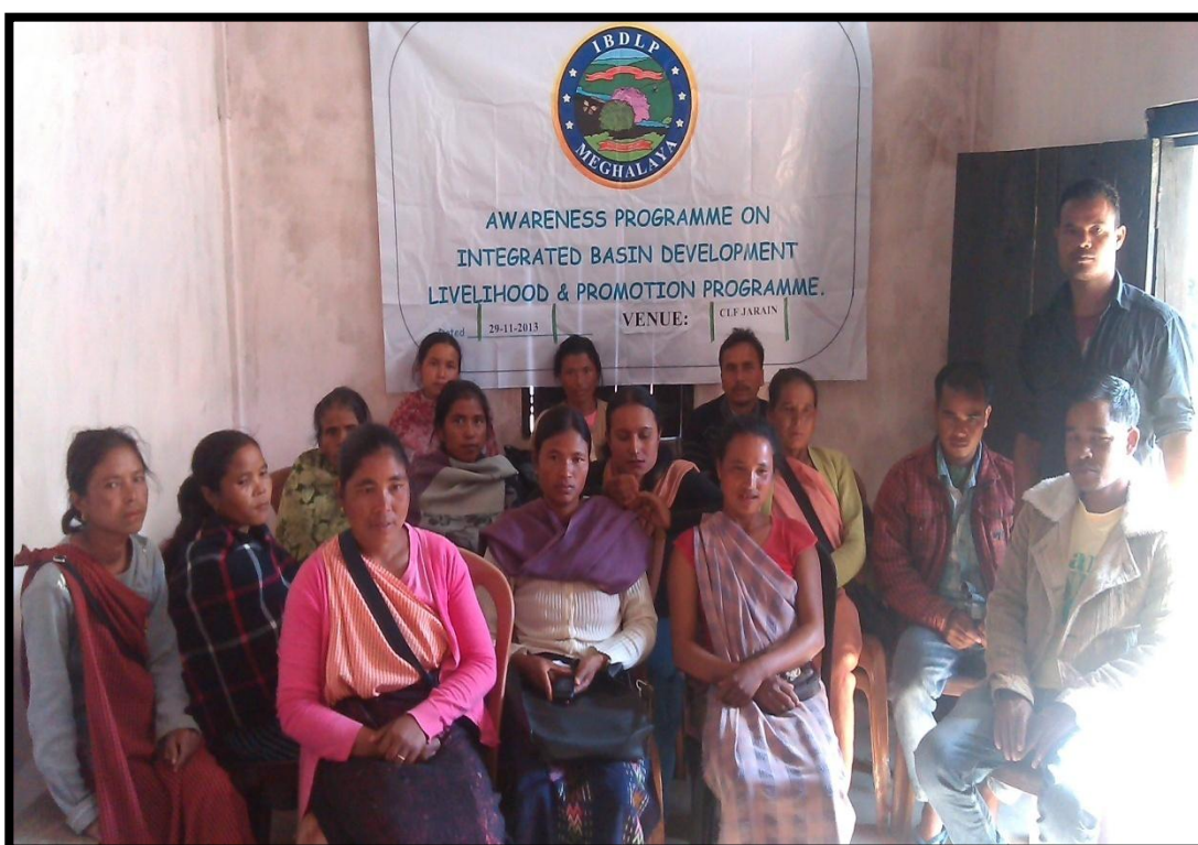
Fig.6: Group photo after the programme, CLF Jarain.