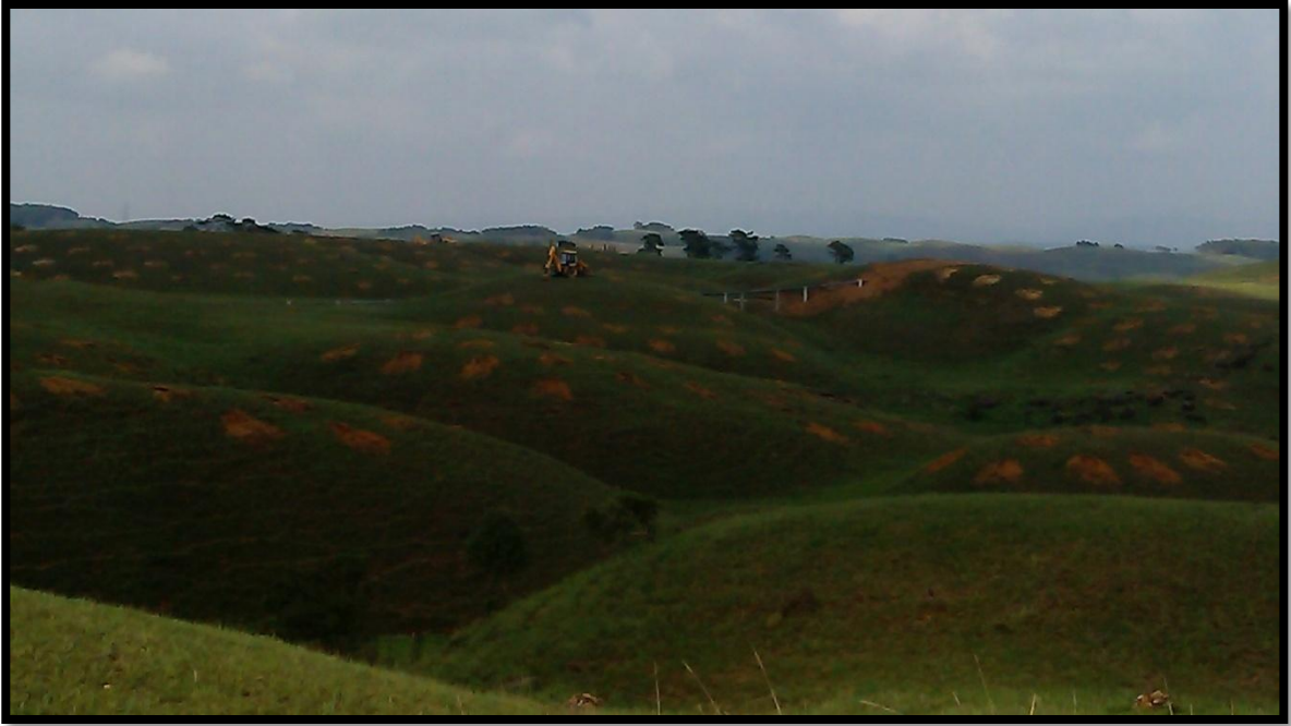
Fig 2:- Pit making for Plantation of Pongamia