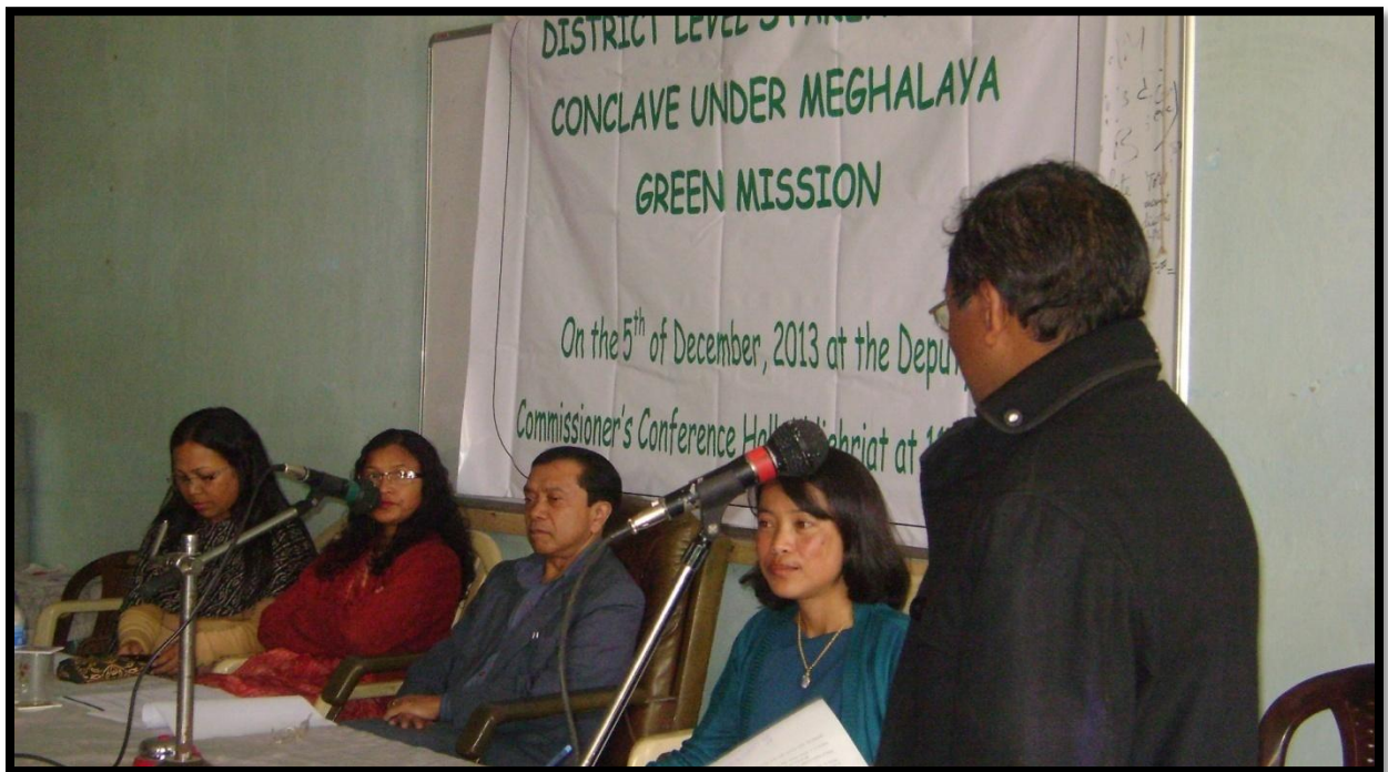
Fig: - 4