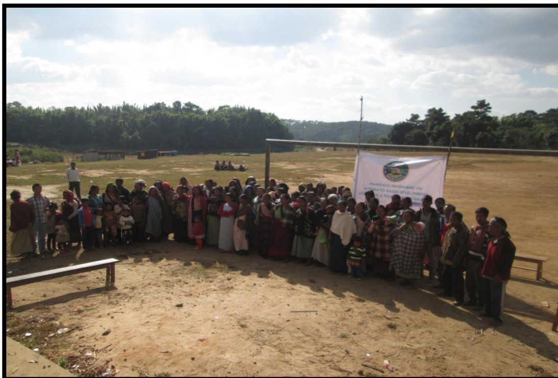
Fig.3: Group photo after the programme, Narwan.