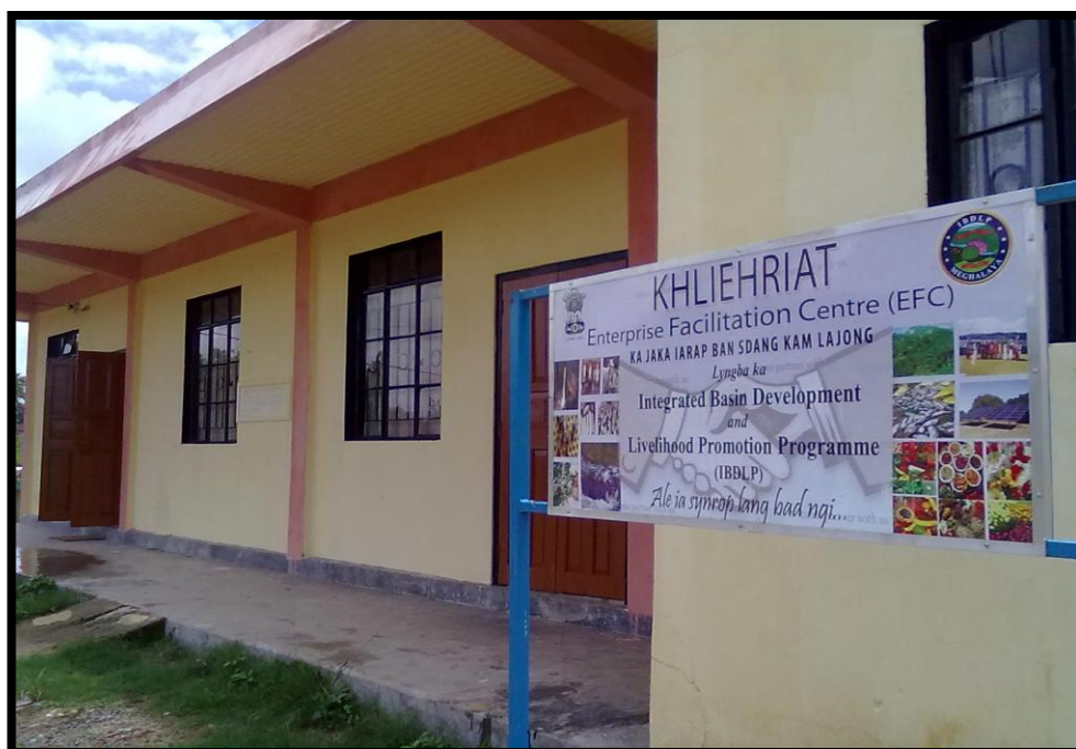
Pic1. EFC Khliehriat, C & RD Block Khliehriat, East Jaintia Hills.