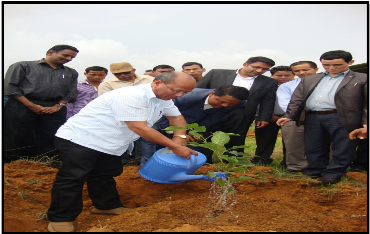
Fig 2:- Launching of Pongamia