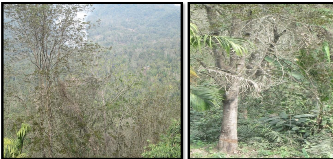
Fig.1: Rubber plants in Wahdiekyiad

In Wahdiekyiad he planted 600-700 of Rubber trees since 2005. With an extraction of rubber he is earning Rs. 1.5 Lakhs per annum as an income. Wahlakhar is just 200 metres from Lukha river in Sonapyrdi village, in this Land the farmer's family usually plant arecanut and also cultivate paddy. But in course of time, the farmer started to do multi activities, like Fish ponds, cultivating vegetables, fruits etc, in order to generate some income from their land.