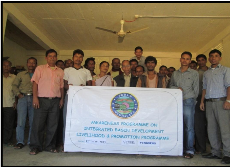
Pic6: Awareness Programme on IBDLP at Tongseng Village in Collaboration with Kduplang CLF.