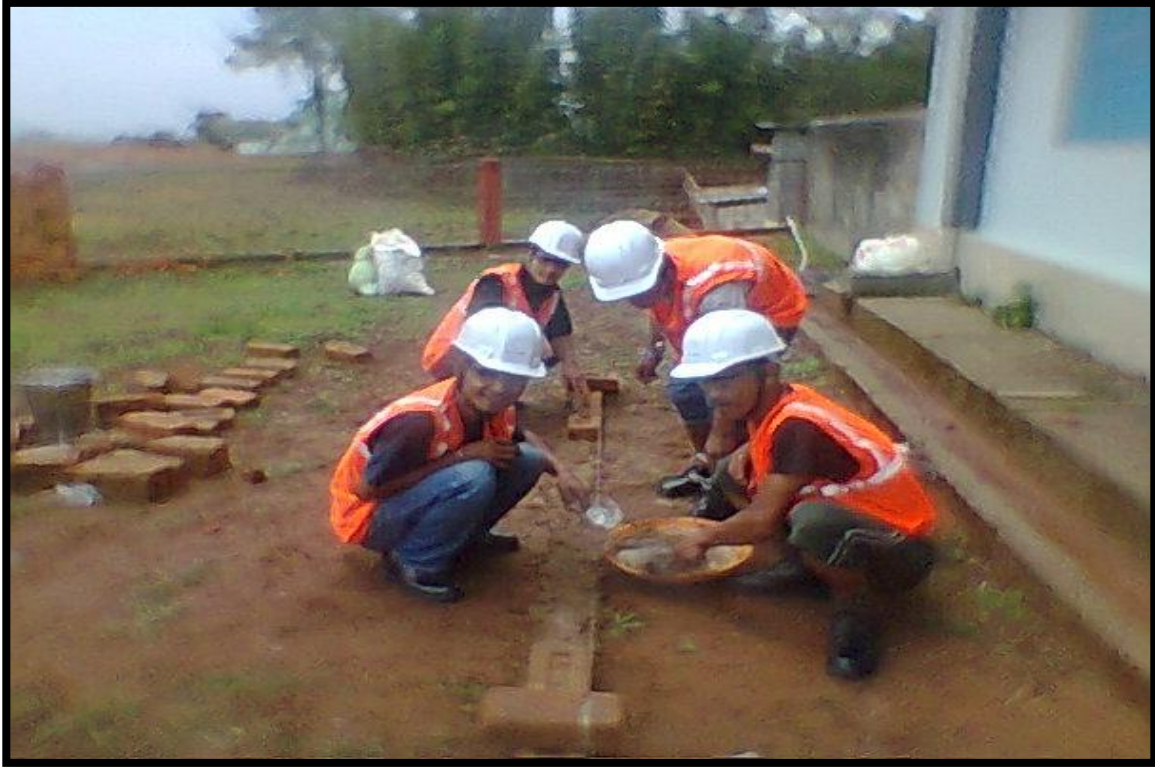
Fig: - Masonry Student

Selection of probable trainees for the courses of Automobile mechanic and Hospitality is under process .The training on Automobile Mechanic will be at Khliehriat higher Secondary School and on Hospitality will be at Umsning, Ri-Bhoi District.