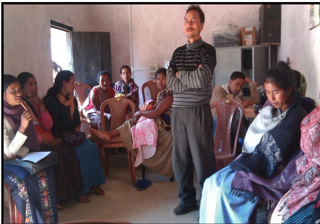
Fig.5: A man interacts during the programme, CLF Jarain.