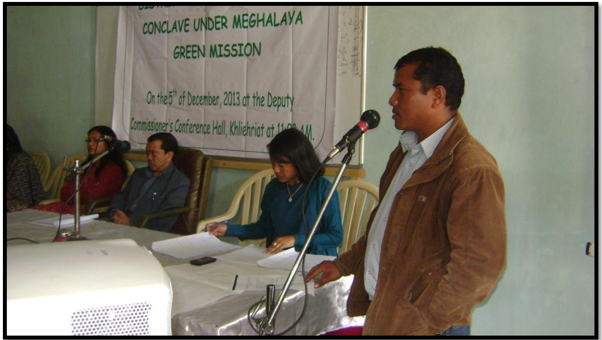
Fig: - 3