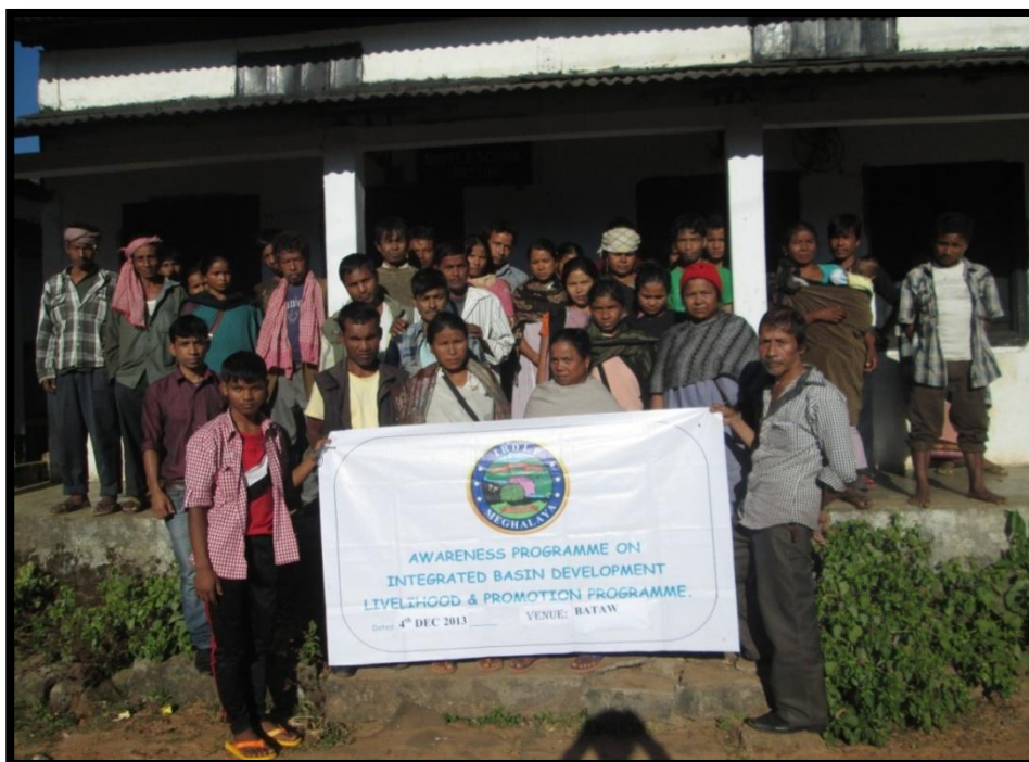
Pic8: Awareness Programme on IBDLP at Bataw Village in Collaboration with Mynjurlang CLF.