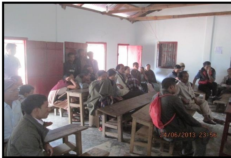
Pic2: Villagers of Shilliang-umchong Village participating in the Awareness Programme on IBDLP.