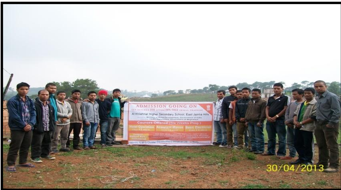
Fig: - Skill Development Students during admission