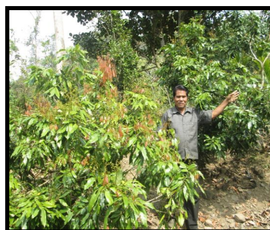
Fig.8: Litchi trees

The partner is very keen to utilise his land in multi-activities in order to earn more income. He has aimed to plant more than 1000 seedlings of rubber trees in Wahlakhar. Besides this he also want to construct more Fish ponds.