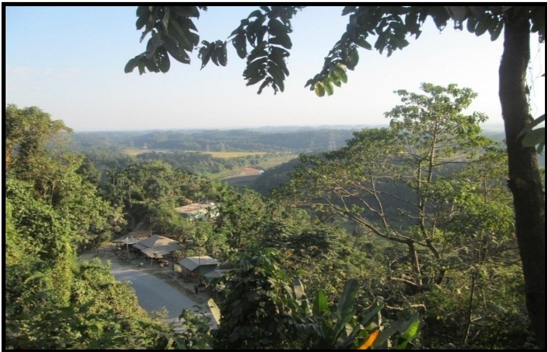
Fig : - 2