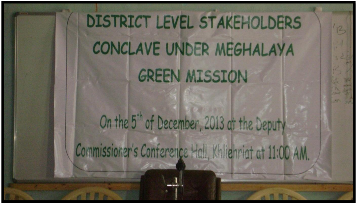
Fig: - 1