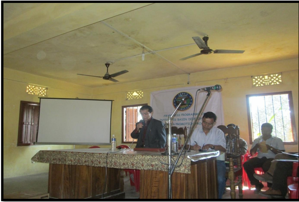
Fig : - 3