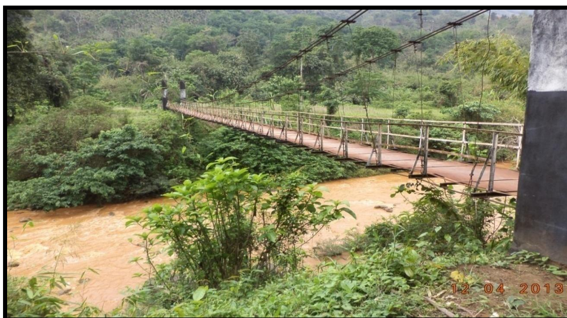
Fig: - Sakri Bridge

To sell their produce sakri's farmers have to trek by foot one hour to reach the main road, this has ultimately force them in selling their hard earned product in distress rate. To address this issue the project constructed the collection centre at Tongseng village which is the end point of their trekking. With the existing of this collection centre it has enable the farmer to stock their Broom Stick, Vegetables, Areca nut and betel leaves before and after the market day. This has not only added value to their produce but also encourage them to invest their time and money in farming.