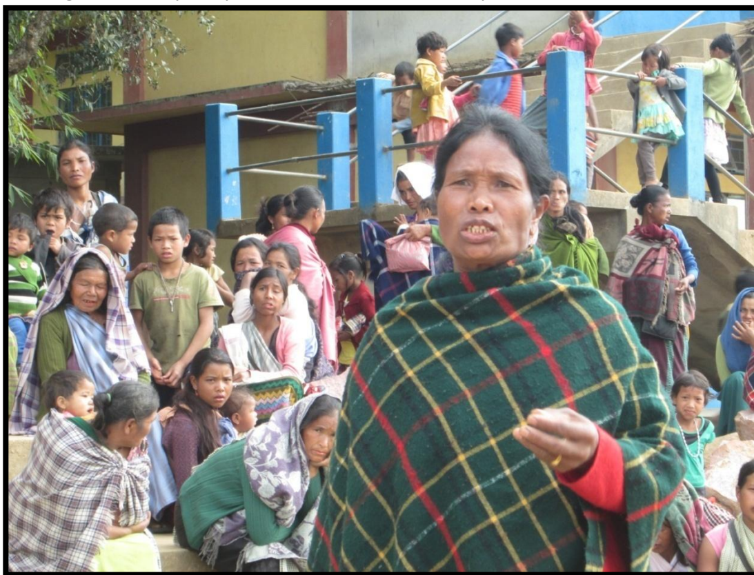
Fig. 2: Woman interacts during the programme, Narwan.