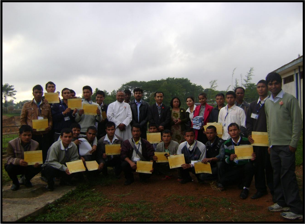
Fig: - Certificate Distribution