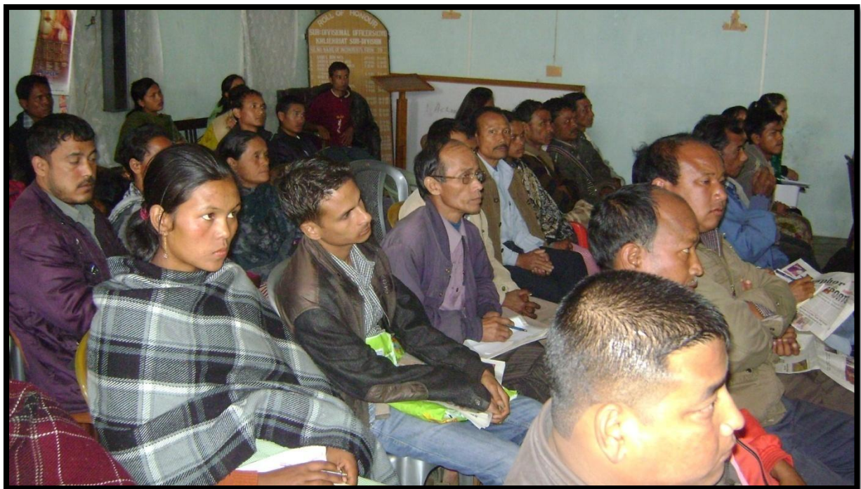
Fig: - 2