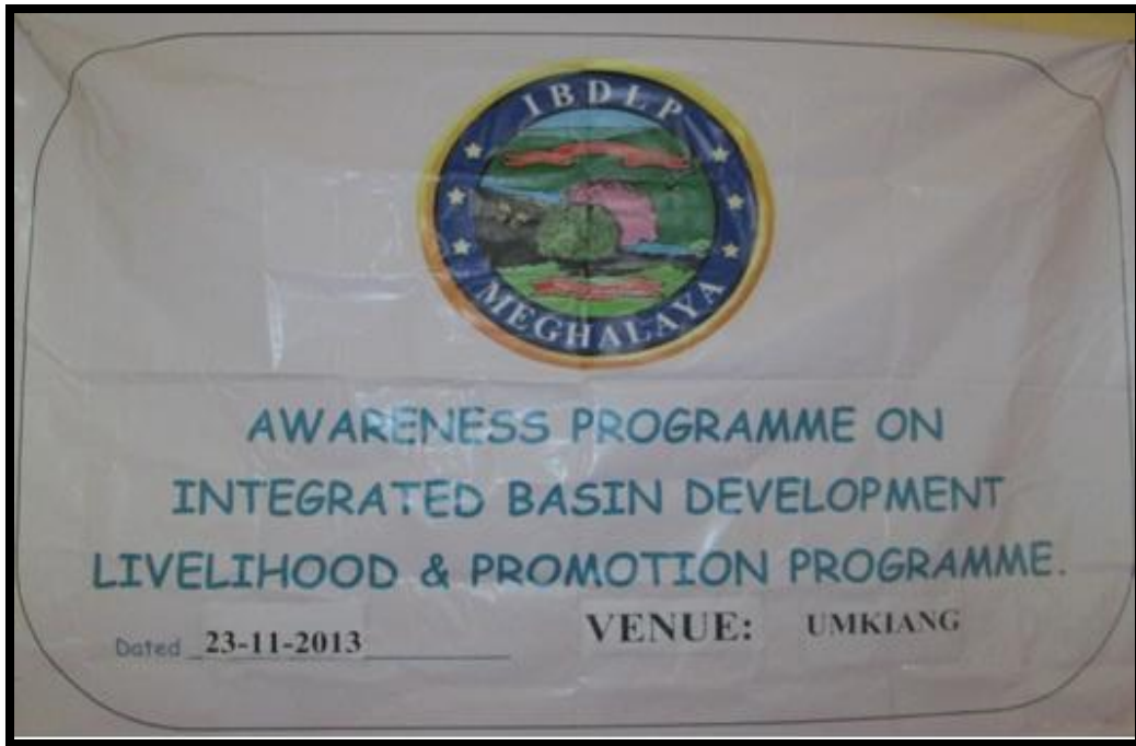
Fig : - 1