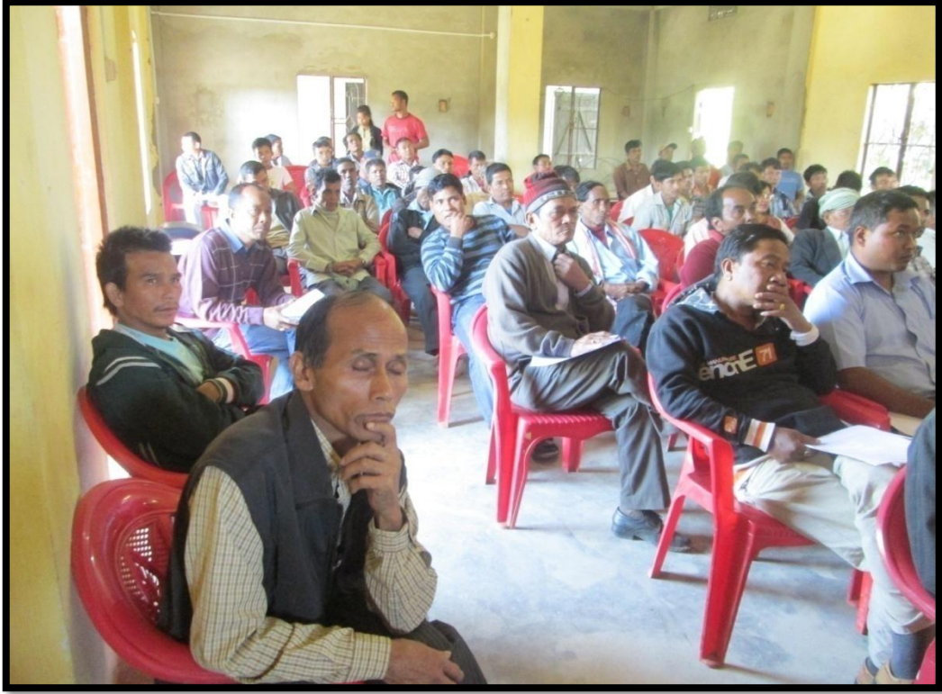
Fig : - 5