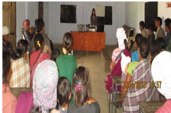
Awareness Programme on IBDLP at Moosakhia Village

The awareness programme on IBDLP for Village Headmen and other stake holders of Amlarem Block was conducted by DBDU West Jaintia Hills District in collaboration with EFC and SDO Amlarem on 6 th June 2013 at Enuwel Hall Amlarem. The Programme was chaired by RO planning Branch, Welcome Speech by SDO Amlarem. In this awareness programme,