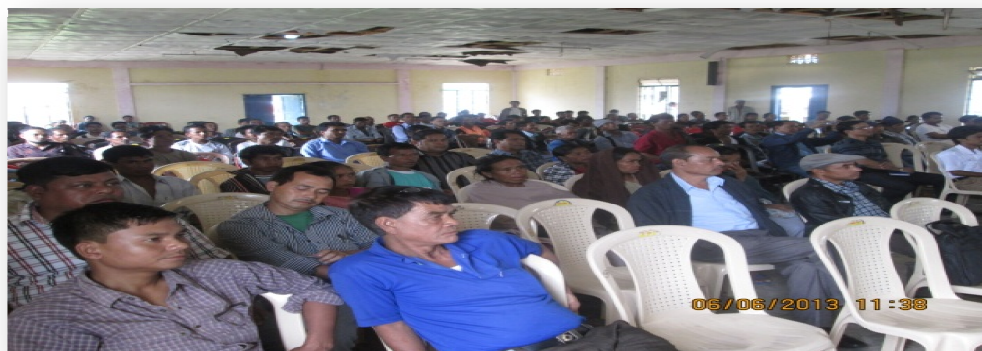
Participants attending the Awareness Programme at Ennowel Hall, Amlarem On 6 th June 2013