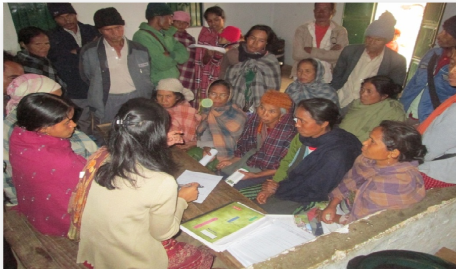
Villagers interacting during a PRA exercise at Larnai Village

The BDU conducted the PRA exercise in the village to work out viable possible interventions.