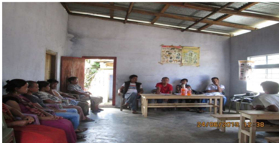
A team from Total Livelihood School, Hyderabad

The villages covered under Amlarem C&RD Block were Amlaririm, Pdengshakap, Amladkhur, Thangbuli (Jarolod),Hawai Bhoi , Trangbalang, Amtasam, Pamtbuh, Khliehamksar, Lamin, Jong-u-Shen, Kudengthymmai, Bakur, Shnongpdeng, Kudengrim, Amsohmeheleng, Mupyut, Samanong and Syndai.