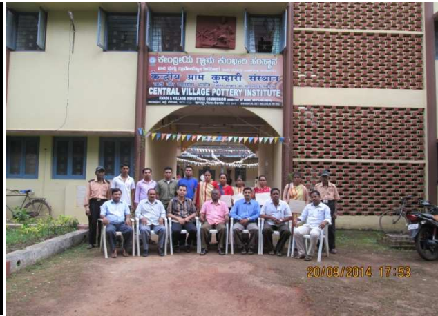
KVIC instructor explaining the art of pottery for the partners from the District.