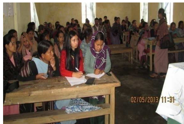
Three days awareness programme was conducted at SGSY Hall C&RD Block Amlarem