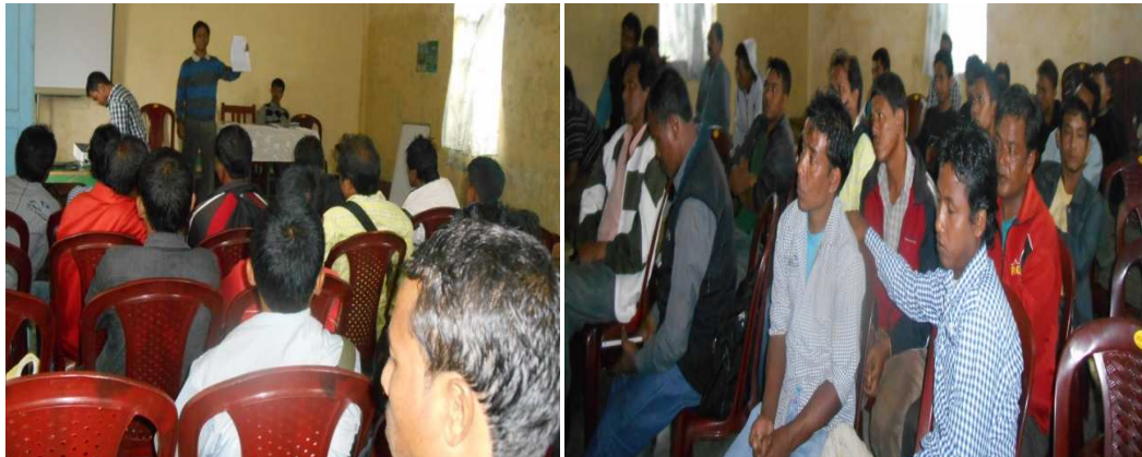
Orientation programme on IVDP