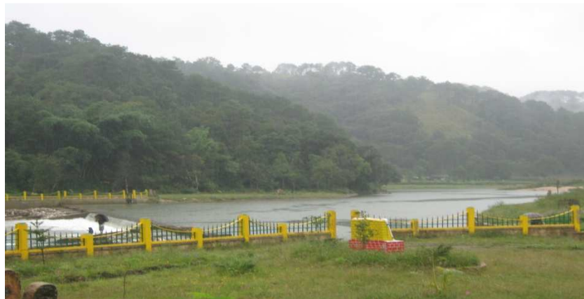
The water pool at Syntu Ksiar