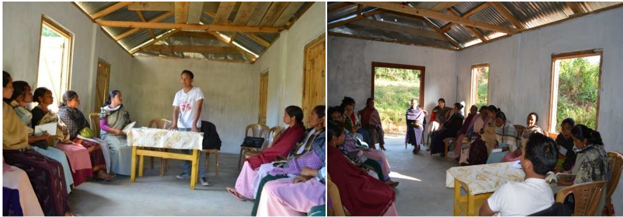
The Awareness programme on IBDLP conducted by BDU at Mookyndeng Village under Laskein Block