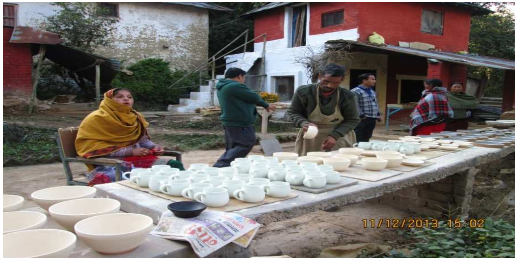
Officials of BDU along with the artisans of Larnai village on an Exposure visit to Andretta Pottery Training Centre, Himachal Pradesh