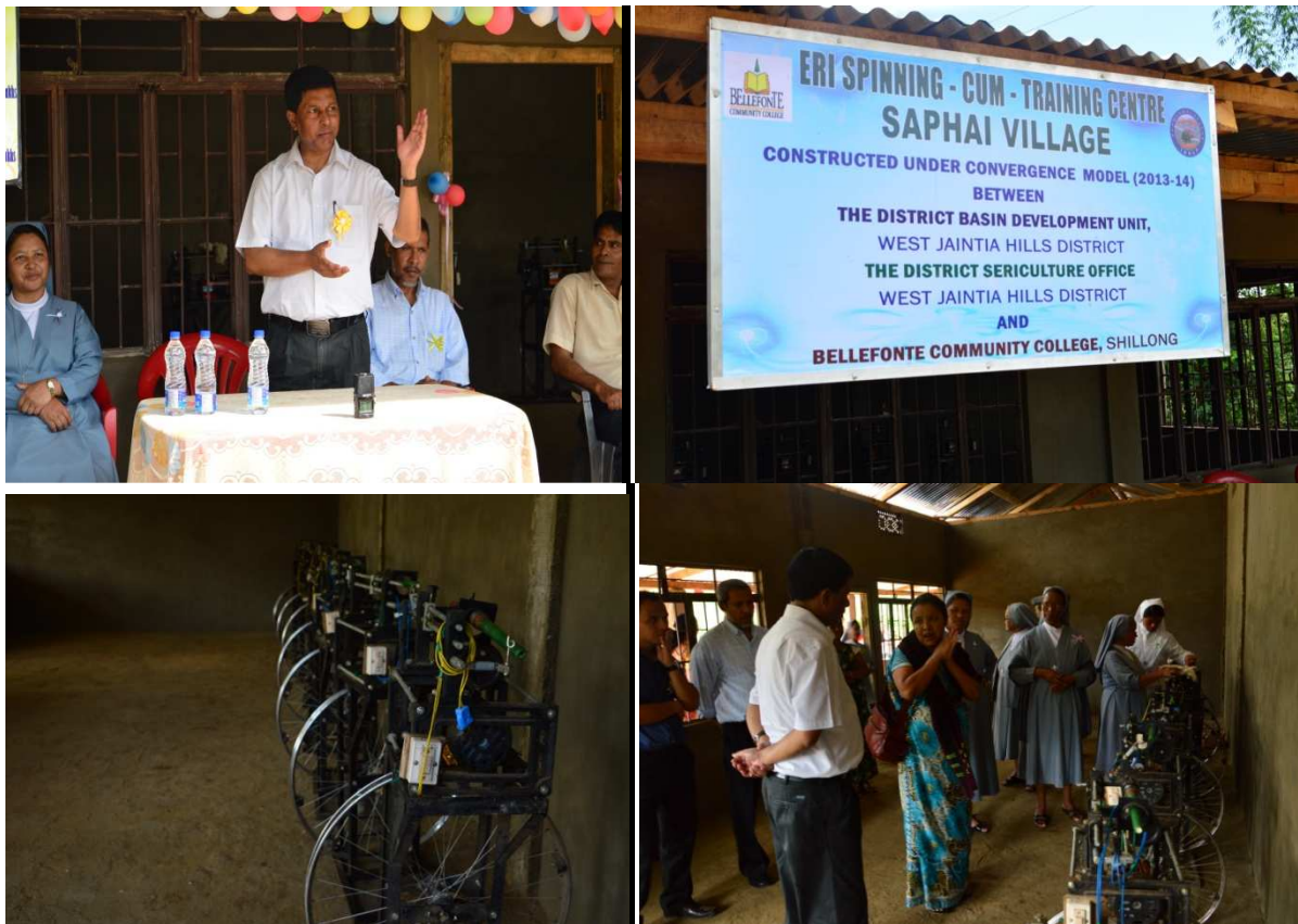
Inauguration of Eri Spinning Cum Training Centre at Saphai Village, Laskein Block on the 11 th July 2014 Construction of Fish Sanctuary at Syntu Ksiar. Total Project Cost-Rs.8, 21,750.00