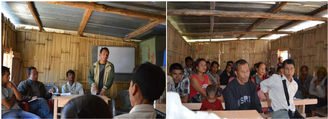
The Awareness programme on IBDLP conducted by BDU at Samatan Village under Laskein Block