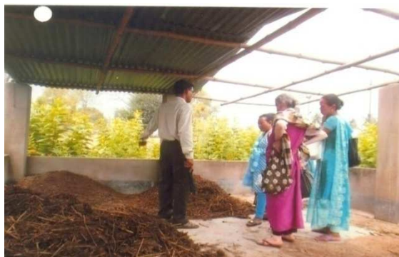
Eri Farmers on an Exposure visit to Central Sericulture Research & Training Institute, Berhampur, West Bengal.