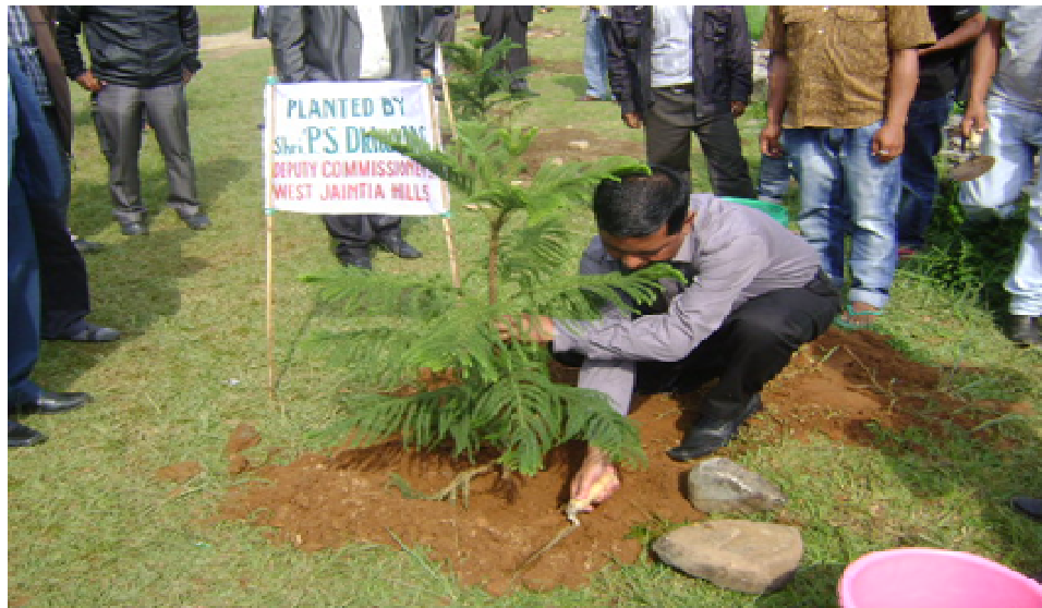
Planting of sapling by Shri.P.S. Dkhar,IAS Deputy Commissioner Planting of sapling by Shri.P.S. Dkhar,IAS Deputy Commissioner West Jaintia Hills District on World Environment Day 2013 West Jaintia Hills District on World Environment Day 2013