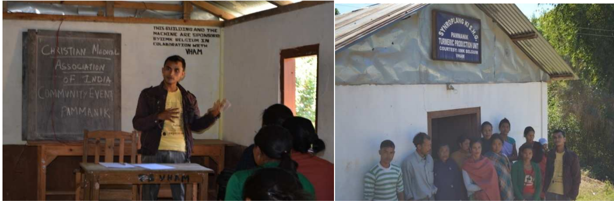
The Awareness programme on IBDLP conducted by BDU at Pammanik Village under Laskein Block