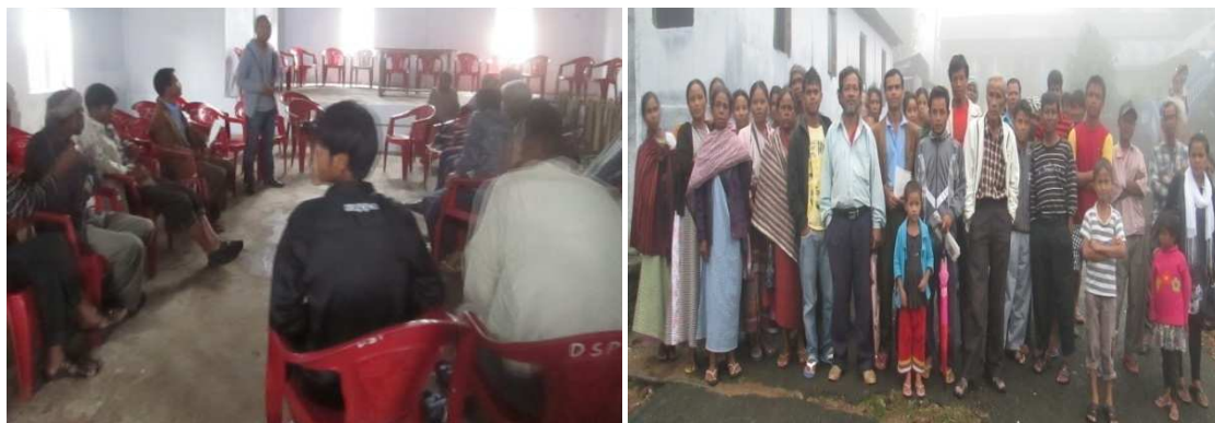
The Livelihood Mapping exercise of Amlarem Block