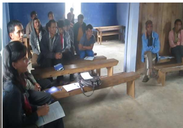
Awareness programme on Beekeeping at Amtapoh village in convergence with DCIC.