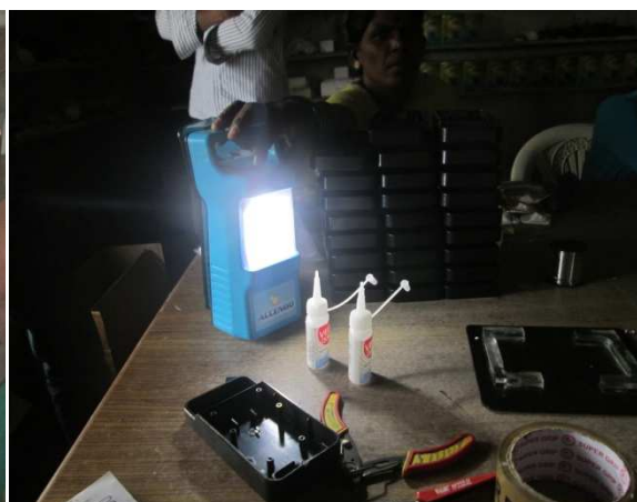
Common demonstration at Solar Energy Section