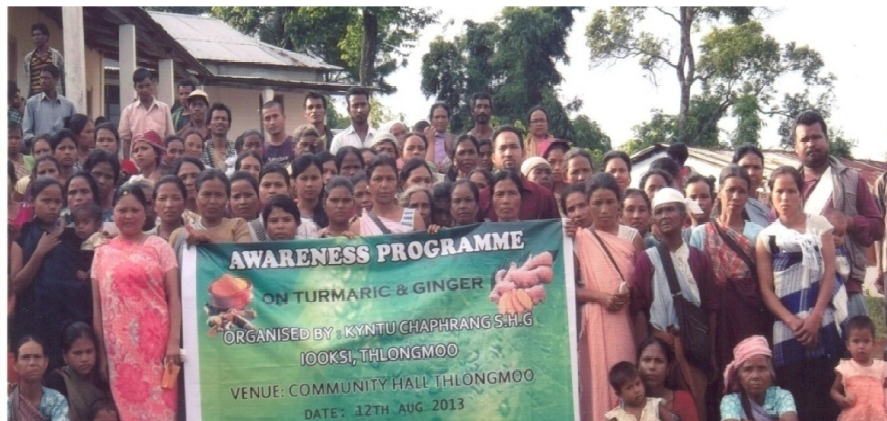
Participants at the Awareness Programme at Thlongmoo, Iooksi under Laskein C& RD Block on 12 th August 2013