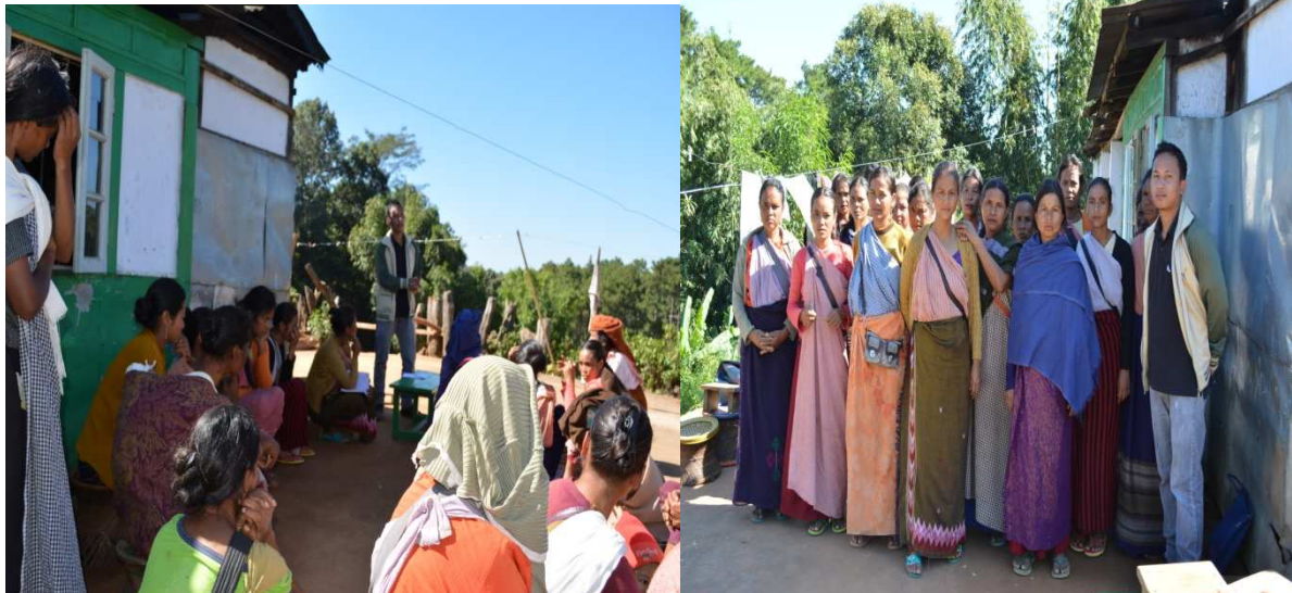
The Awareness on IBDLP conducted by BDU at BIAR Village under Laskein Block

The Awareness programme on IBDLP conducted at Laskein Block of West Jaintia Hills. The following villages are 1.Samatan 2.Umsalait 3.Thangrain