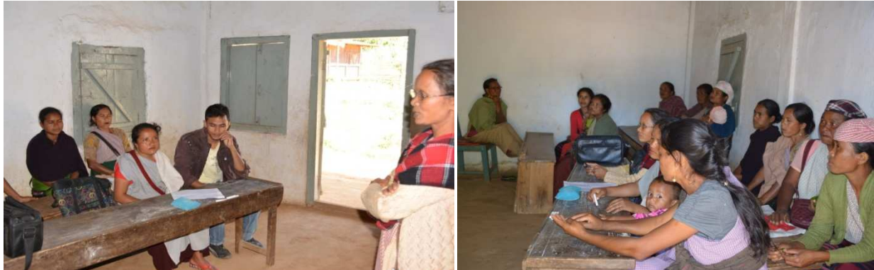
The Awareness programme on IBDLP conducted by BDU at Mawtyrsiah Village under Laskein Block