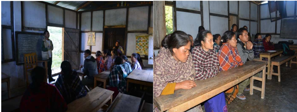
The Awareness programme on IBDLP conducted by BDU at Kyndong Mynso Village under Laskein Block