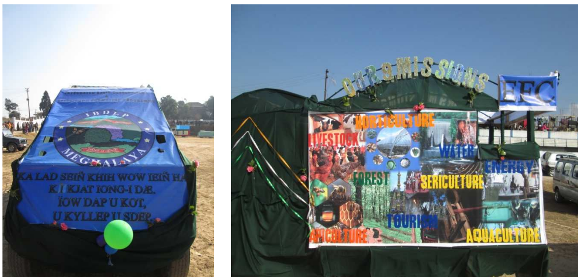
Tableau on IBDLP on 26 th January, 2013.

On the occasion of the 56 th Republic Day Celebration, the District Basin Development Unit took the opportunity to showcase and display a tableau on Integrated Basin Development and Livelihood Promotion Programme in the District which depicted the 9 (Nine) missions in attaining the objective of sustainable livelihood.