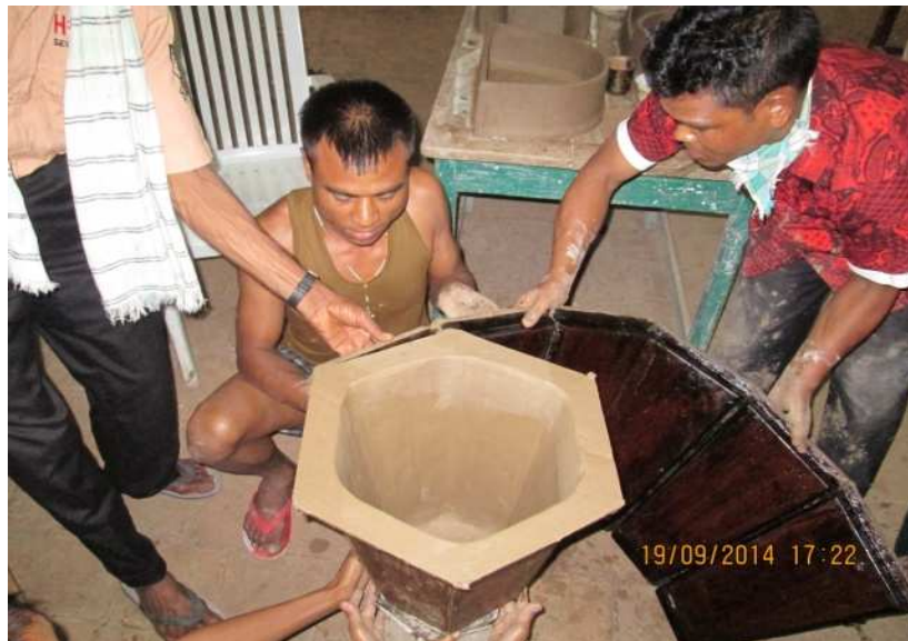
Artisans removing the frame for making Garden Pot