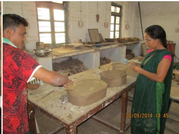
Artisans making Bonsai.