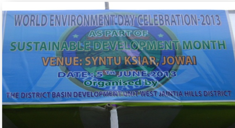
Sustainable Development Month.

The BDU has submitted a proposal to MIE for utilizing the facilities of the Women's Group and Handicraft Multipurpose Co-operative Society Ltd. Mowkyndeng as the training Centre on handicrafts for Artisans of the State.