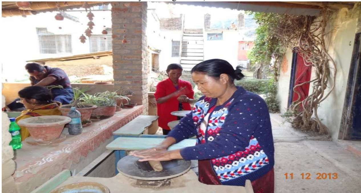
Artisans from Larnai Village putting hands on at Andretta Pottery Training Centre, Himachal Pradesh.