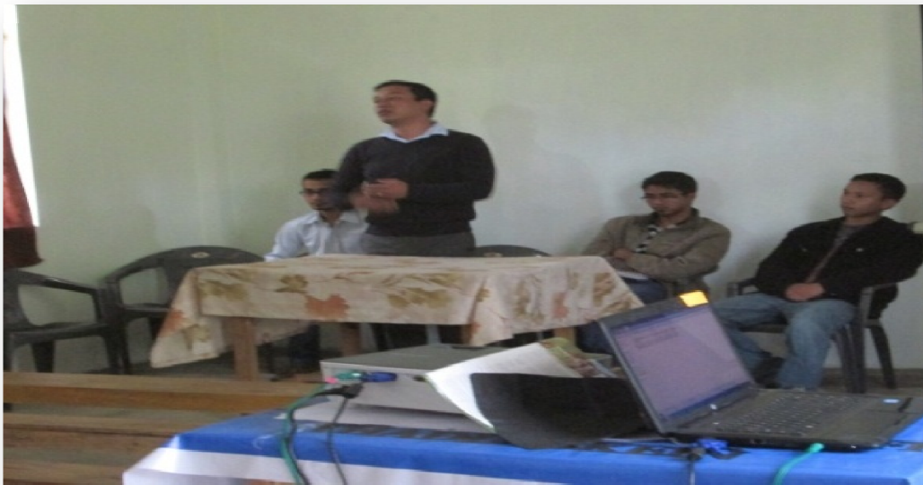
Officials from DCIC Jowai briefing partners during the DPP Programme at Laskein EFC