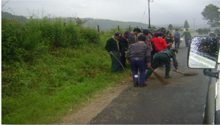
Cleaning drive at Syntu Ksiar as part of Sustainable Development