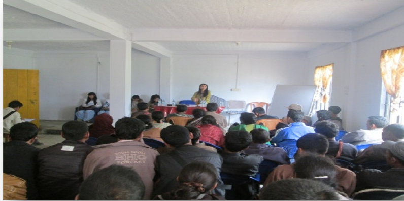
Dialogue with Partners Programme at Thadlaskein EFC.