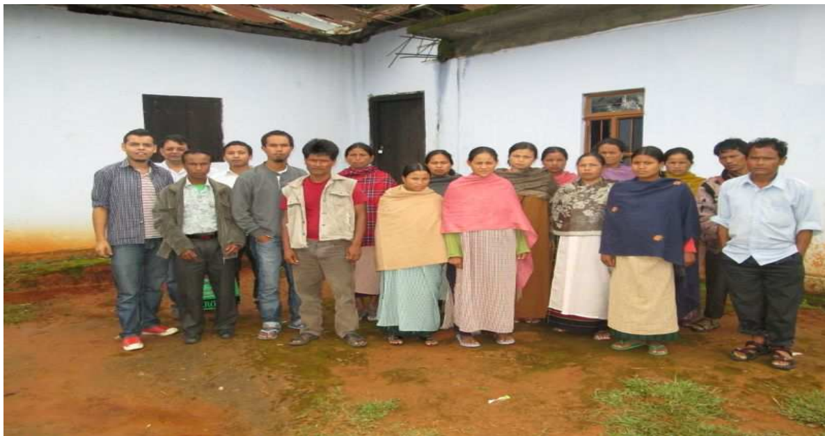
Official from WEBCON Ltd during livelihood mapping at Kyndongtuber