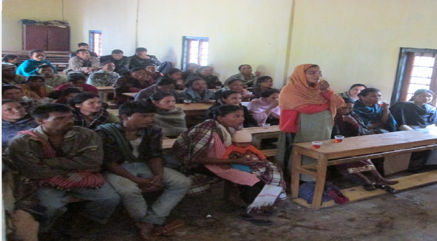
Partners at the DPP Programme at Amlarem EFC on 4 th May, 2013