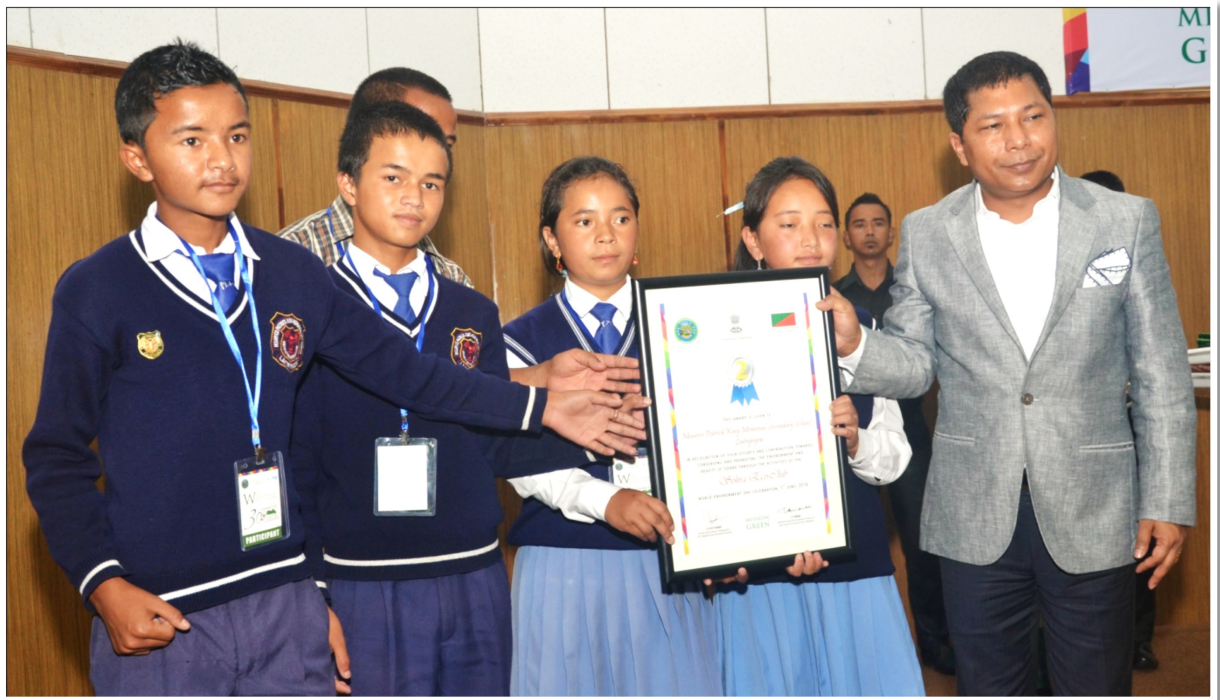
Chief Minister Dr Mukul Sangma presents an award to members of Maurice Patrick King Memorial Secondary School, Laitryngew, in recognition of their efforts as part of the Sohra Eco Club during the inaugural session.