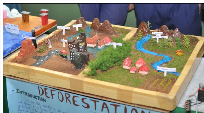
(Above) A diorama produced by the students of Brookside Higher Secondary School on deforestation.