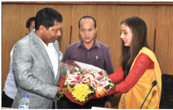
Chief Guest Dr Mukul Sangma, Chief Minister of Meghalaya, being felicitated during the inaugural session.

World Environment Day 2014 was celebrated in Shillong on 5 th June with several programmes at the State Convention Centre. The theme this year was Raise Your Voice, Not the Sea Level and the key message from the day was to bring the youth on board to create positive change and be involved in the decision-making process. The raising of the sea level is essentially down to climate change, an issue that affects Meghalaya directly. Actionable ideas were put forward in the breakout groups, panel discussions and were demonstrated through a fashion show that highlighted Meghalaya's ability to create a sustainable business that can generate employment and put the state's name on the global map while remaining environmentally friendly.