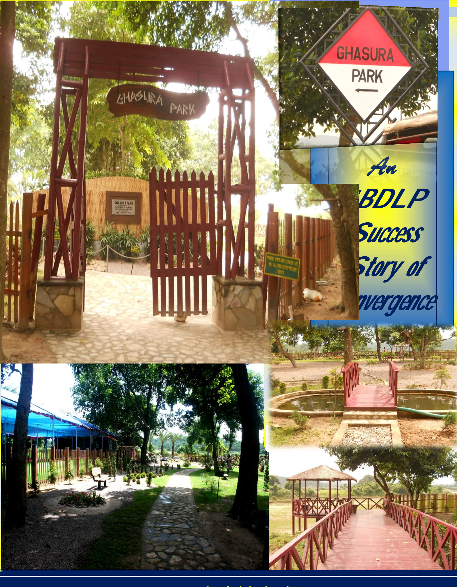
An Initiative by: Basin Development Unit, West Garo Hills, Tura