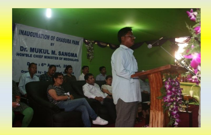
Cultural events being showcased during the inaugural of the Ghasura Park on 6<sup>th</sup> August, 2012 at Ampati