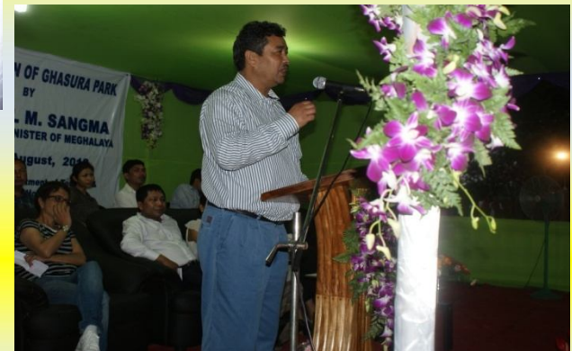
Dignitaries present during the inauguration of the Ghasura Park on 6 th August, 2012, Ampati