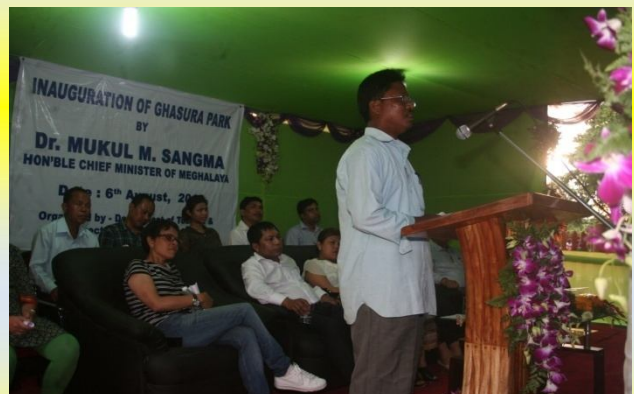
Cultural events being showcased during the inaugural of the Ghasura Park on 6 th August, 2012 at Ampati