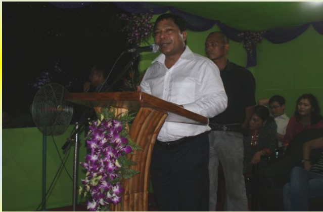
Hon'ble Chief Guest, Dr. Mukul M. Sangma, CM addressing the gathering during the inaugural event