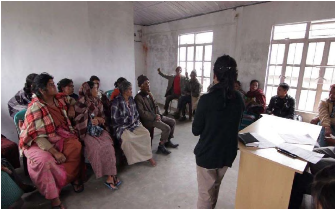
Picture 3.5: Showing Focus group discussion in Tuber Sohshrieh Village