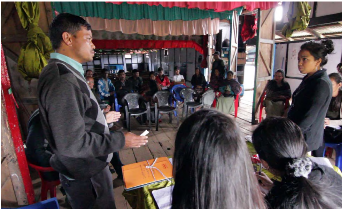
Picture 3.1: Showing Focus group discussion in Sabah Muswang Village