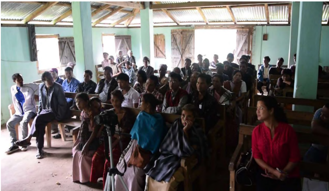
Picture 6.4: Showing the disapproval for the construction of Toll Plaza