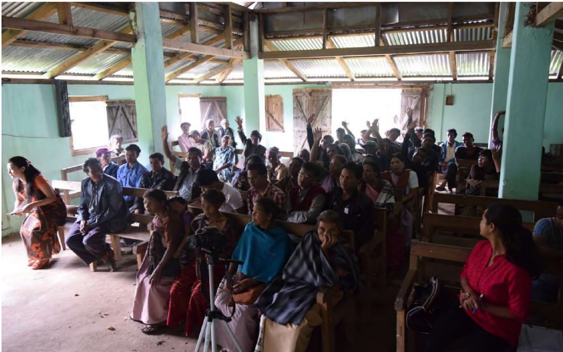
Picture 6.3: Showing the approval of people for the road widening project