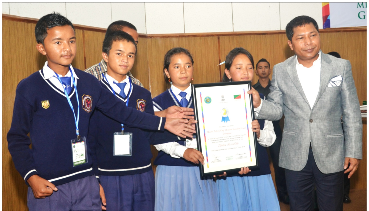
Chief Minister Dr Mukul Sangma presents an award to members of Maurice Patrick King Memorial Secondary School, Laitryngew, in recognition of their efforts as part of the Sohra Eco Club during the inaugural session.

A performance was given by the Aroha Choir with an environmental message and there were two short video messages by Mr Achim Steiner, Executive Director of the United National Environment Programme, Nairobi, and Miss Karen David, Khasi singer-songwriter and actor, followed by the presentation of awards/citations to winners of the Eco Clubs and Greenathon as well as a ceremonial planting of trees.