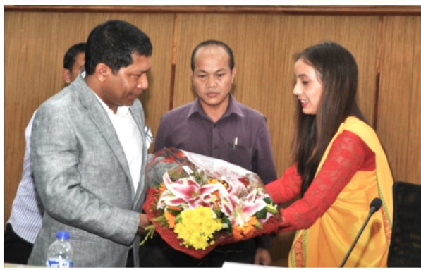
Chief Guest Dr Mukul Sangma, Chief Minister of Meghalaya, being felicitated during the inaugural session.

World Environment Day 2014 was celebrated in Shillong on 5 th June with several programmes at the State Convention Centre. The theme this year was Raise Your Voice, Not the Sea Level and the key message from the day was to bring the youth on board to create positive change and be involved in the decision-making process. The raising of the sea level is essentially down to climate change, an issue that affects Meghalaya directly. Actionable ideas were put forward in the breakout groups, panel discussions and were demonstrated through a fashion show that highlighted Meghalaya's ability to create a sustainable business that can generate employment and put the state's name on the global map while remaining environmentally friendly.