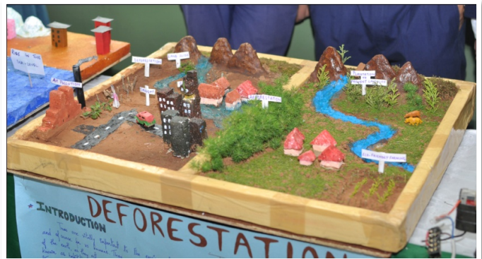
(Above) A diorama produced by the students of Brookside Higher Secondary School on deforestation.