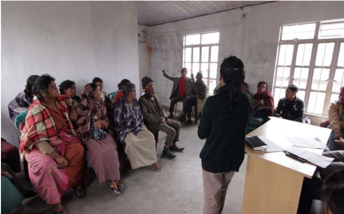
Picture 3.5: Showing Focus group discussion in Tuber Sohshrieh Village